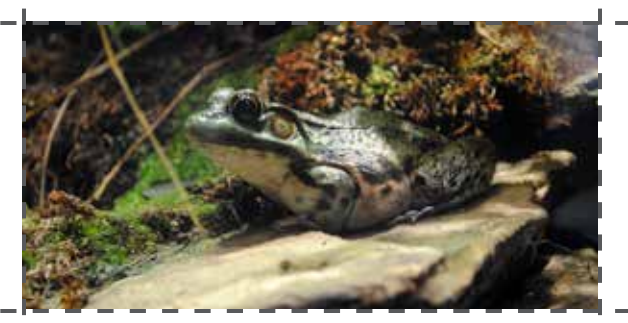
1st floor: Frogs and Toads