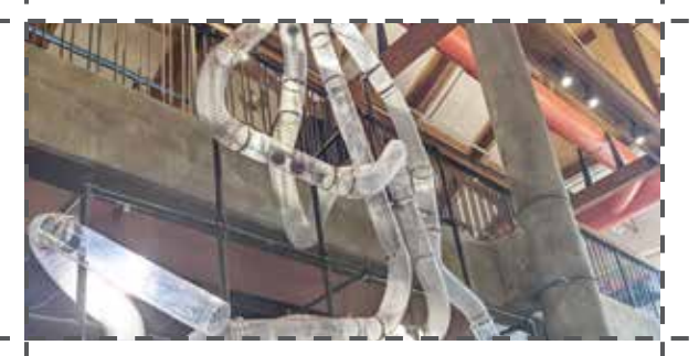
1st floor: AirWorks