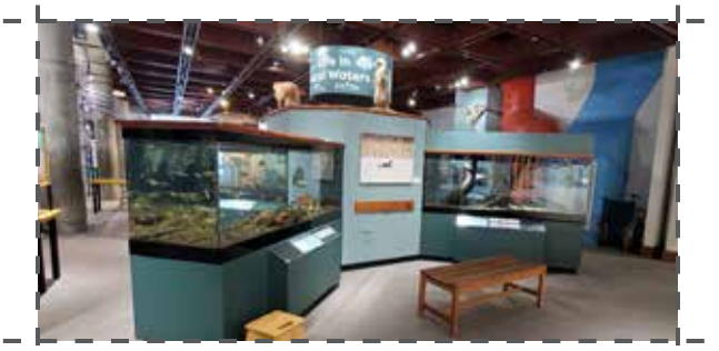
1st floor: Life in Local Waters