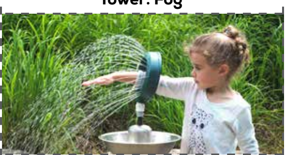
Outdoors: David Goudy Science Park