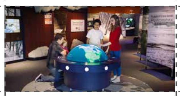
2nd floor: Under the Arctic