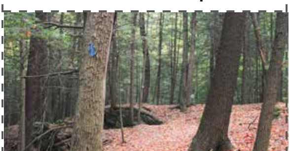
Outdoors: Ridge Trail