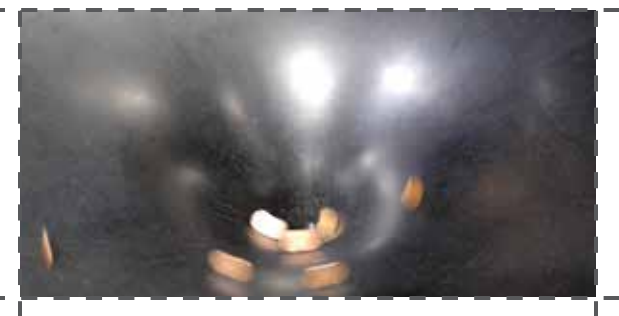
1st floor: Give it a Whirl