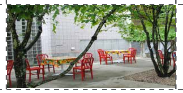
Outdoors: Dining Space