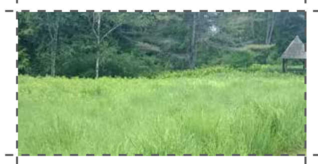
Outdoors: Meadow Walk