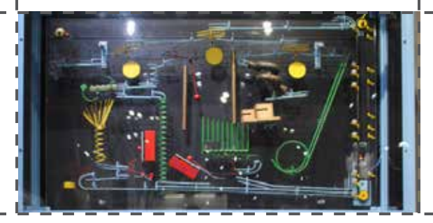
1st floor: Ball Machines