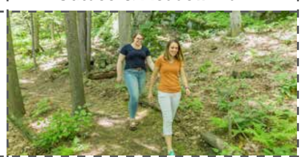
Outdoors: Woodland Garden