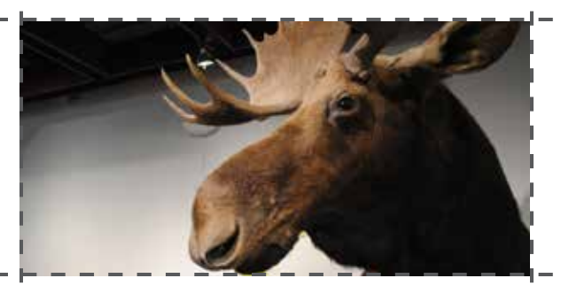
1st floor: The Natural World