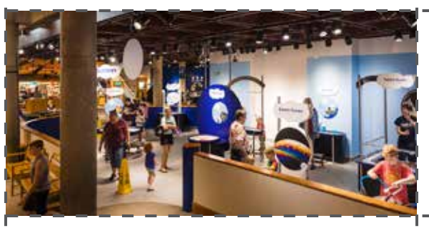
1st floor: Bubbles