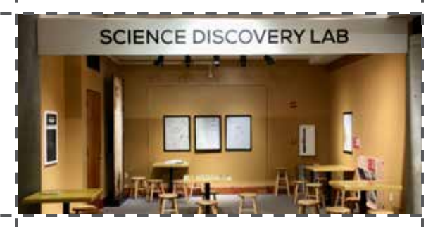
2nd floor: Science Discovery Lab