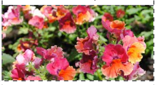
Outdoors: Venus Garden