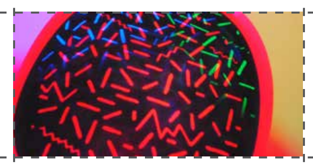
Tower: Light Around Us