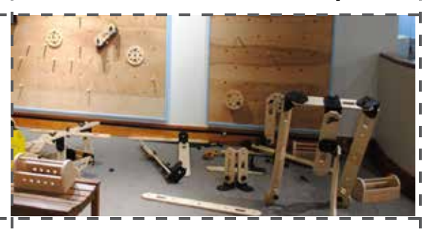
2nd floor: Creative Building Center