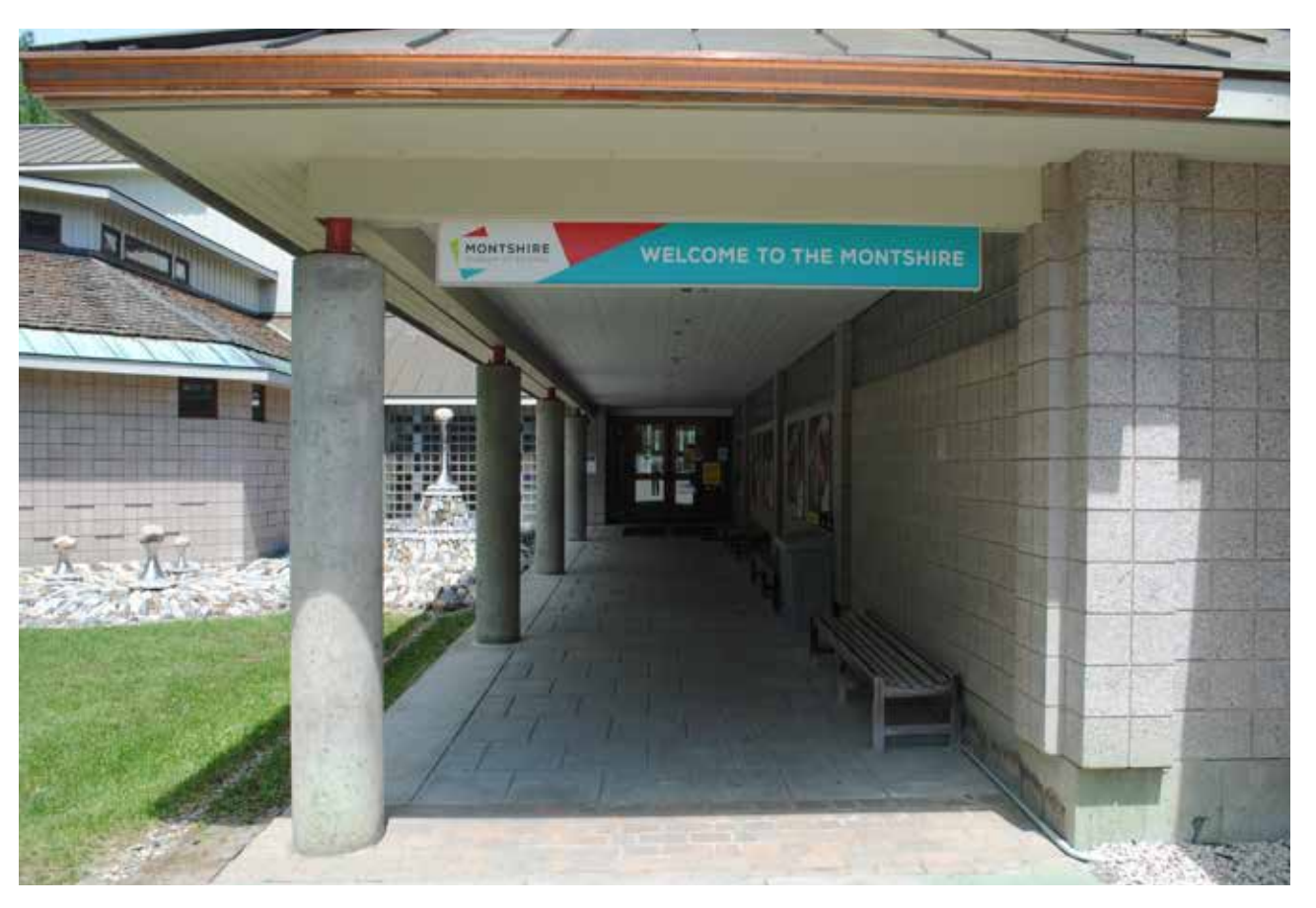
Developed with guidance from the Special Needs Support Center.